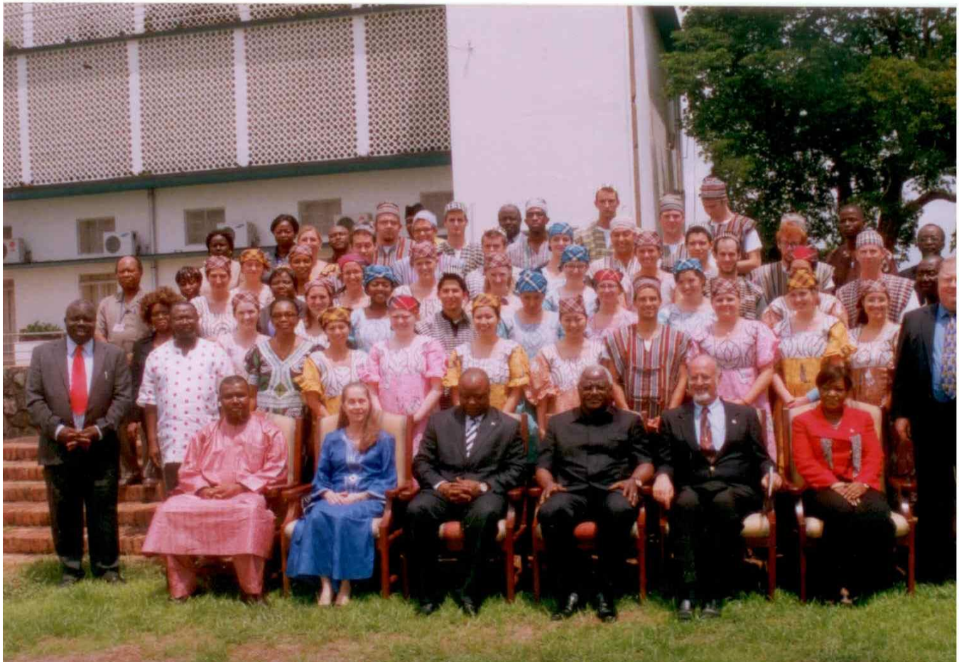
President Ernest Bai Koroma and the new crew of Peace Corps Volunteers in Sierra Leone.

Cell: 232-78-464-244 Email: jwallach@sl.peacecorps.gov