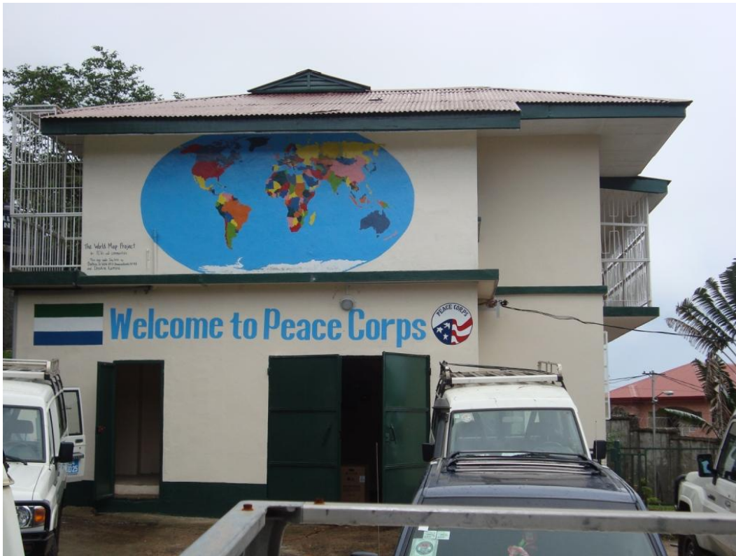
The Peace Corps Medical Unit