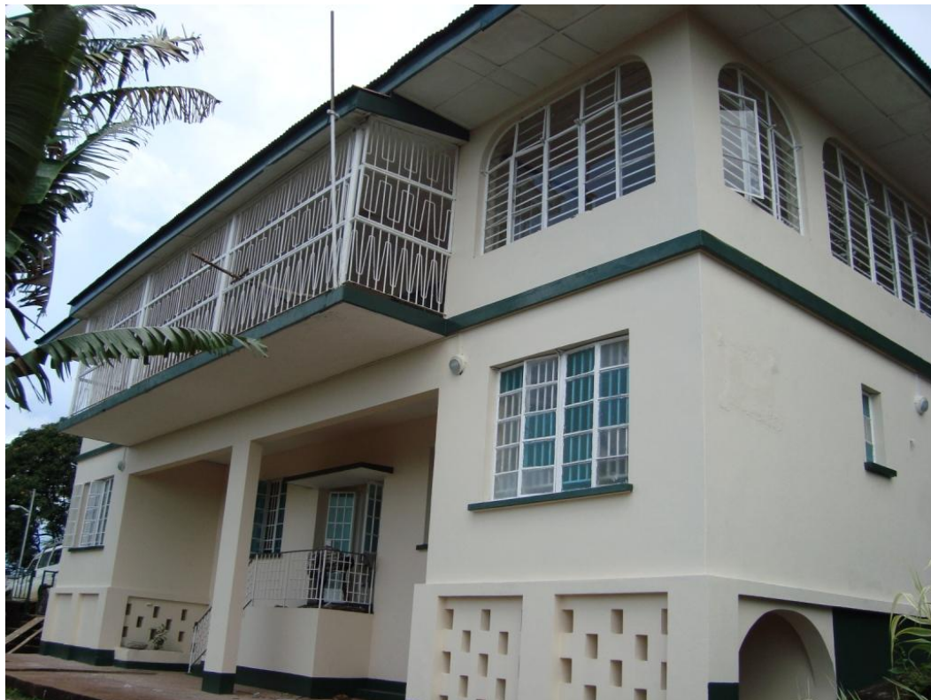
The Peace Corps Hostel